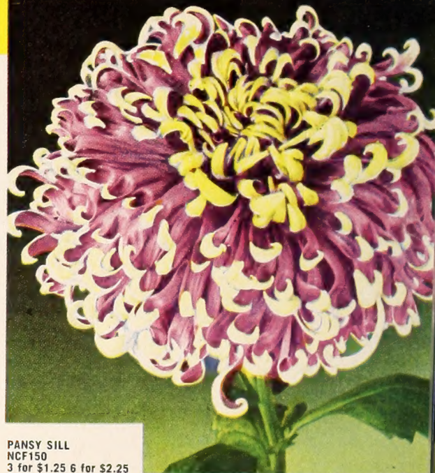
PANSY SILL NCF150 3 for $1.25 6 for $2.25

NCF164 PAULA — A spectacular recent introduction of special merit. Quilled part is buff yellow and broad spoon opens to an amazingly lovely bright crimson.